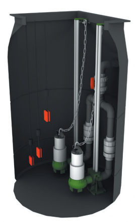
Twin pump chamber