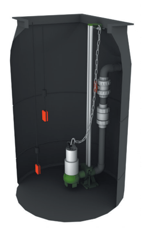
Single pump chamber

A control panel kiosk & tank extensions (500 mm height) are available as an optional extra.